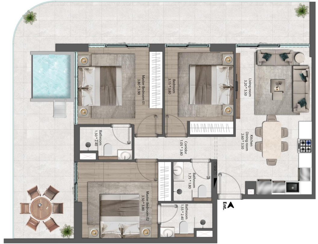
3BR | 04 UNITS (1609.25 SQFT)