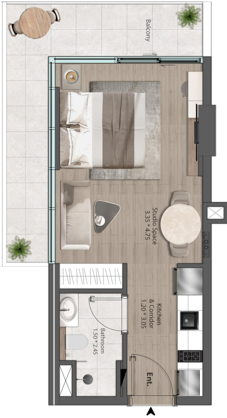
STU (409.25 SQFT) | 02 UNITS