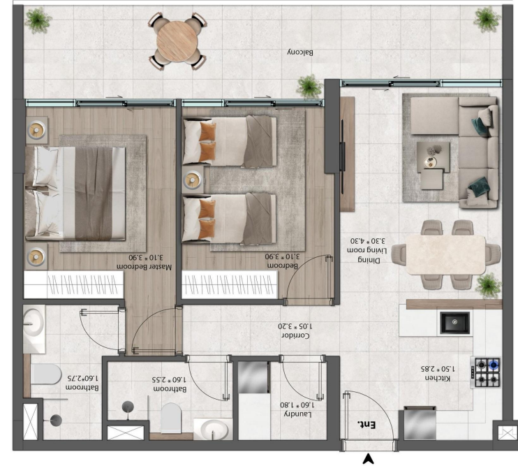
2BR-T04 | 32 UNITS (952.40 SQFT)