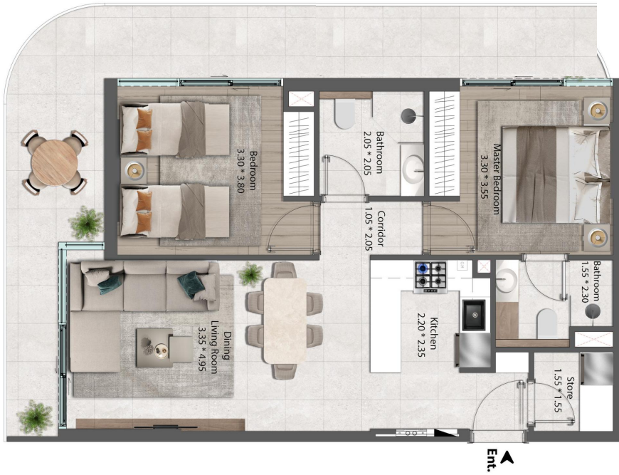
2BR-T03 | 04 UNITS (1090.80 SQFT)