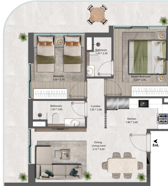
2BR-T02 | 09 UNITS (1067.45 SQFT)