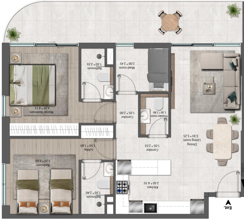
2BR + Maid | 06 UNITS (1175.85 SQFT)