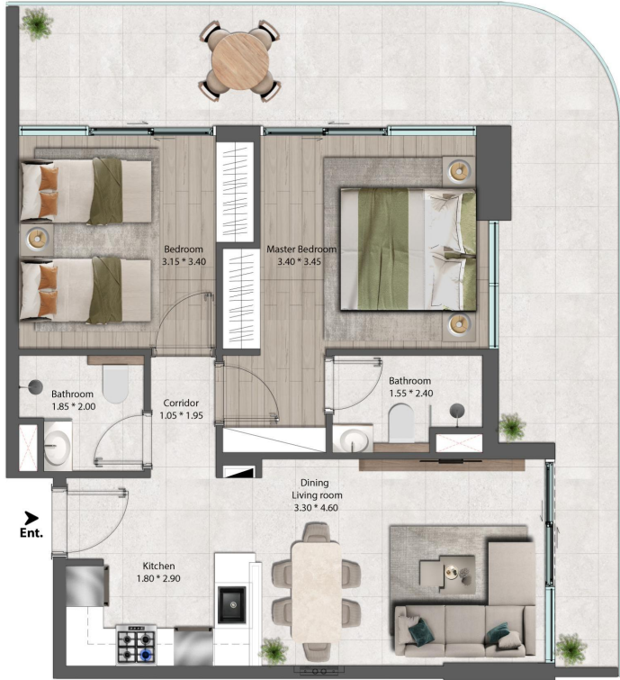
2BR-T01 | 03 UNITS (1085.10 SQFT)