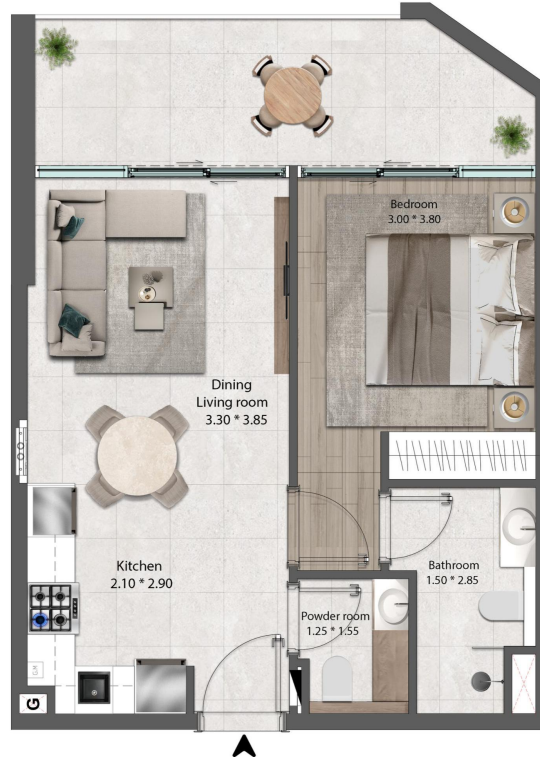
1BR-T01 (626.35 SQFT) | 31 UNITS