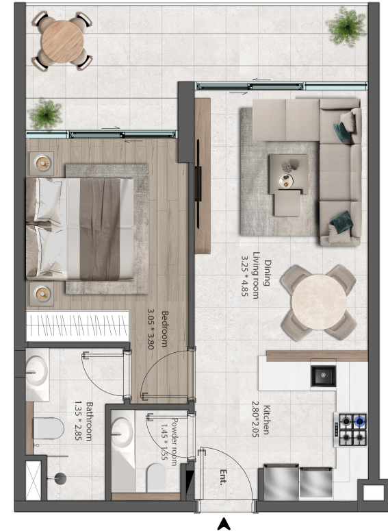
1BR-T02 (643.15 SQFT) | 22 UNITS